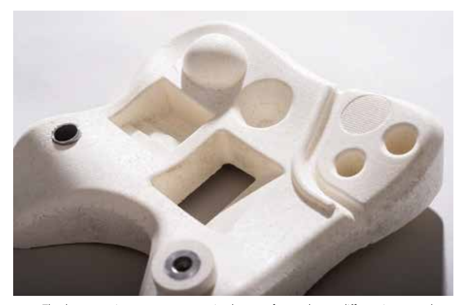
Fig. 1. The demonstration component contains, by way of example, two different inserts and shows possible geometries with a defined surface structure that can be achieved with the newly developed PMI foam

Polyurethane (PU) can be foamed directly in the mold in a chemical reaction and so the resultant foam has the final geometry. This technology therefore saves other shaping steps; the starting materials are also inexpensive. However, the thermal and mechanical properties of this structural foam are not optimum for modern production methods such as high pressure RTM or wet pressing, which are favored for the production of longer runs. In addition, there are health and